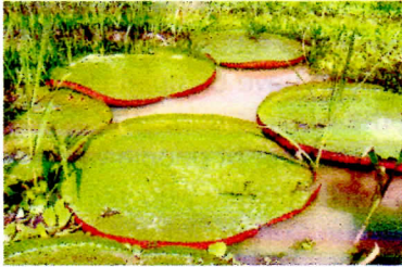
You don't get a good idea of scale from the photo. These lily pads are 2 meters across.

Next morning off we went in a boat for an inter lake trek and fishing. The boat met us at a predetermined pickup location with bait, fishing lines and poles - we are going after the Piranha. I managed more out of luck more than skill to catch the biggest one, which was grilled for us at our evening meal. That afternoon we did another boating adventure in another direction being dropped off and picked up later at another location. Birds, monkeys, bugs trees and so on continued to enter the picture.