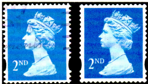
A. lithography B. Photogravure

There are hundreds of varieties of the stamps known as Machins. They are named after Arnold Machin who sculpted the bas relief of the Queen's profile that is the focus of these simple elegant stamps.